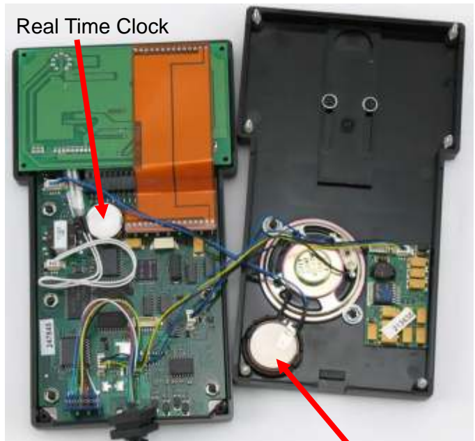
Real Time Clock

Some keypads with serial numbers in the 1400 - 1568 range and older keypads that have had major repair done.